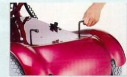
Rear wheel with mechanical clutch system (use brake release lever)