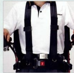
Seat belt design