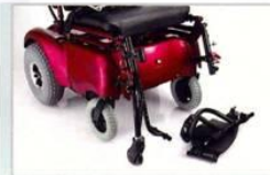
Detachable swingaway footrest